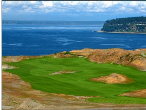
Chambers Bay (2015 US Open, 2008 AAC)